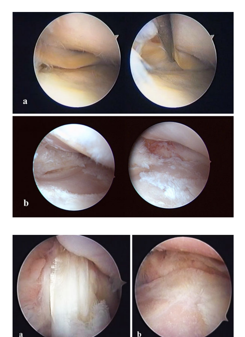
Fig. 2 A 27-year-old male patient, 12 years after index surgery (arthroscopic appearance at second-look examination). a ACL appearance and b Meniscal appearance on second-look arthroscopic examination

The prevalence of meniscus tears seems to be high in ACL-deficient patients [12]. For meniscus transplantation, ligament stabilisation is recommended either before or concomitantly during meniscus transplantation in an unstable knee because meniscus repairs result in superior healing in stable knees [14, 15, 23]. Spang et al. [23] evaluated the effect of meniscectomy and meniscal allograft transplants on anterior cruciate ligament and knee biomechanics in 10 human cadaveric knees. They showed